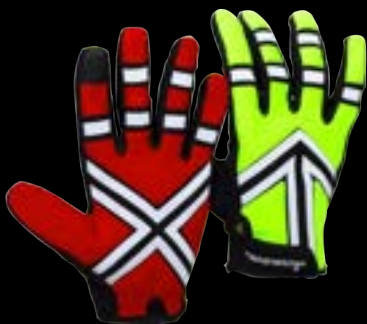
Day time full length