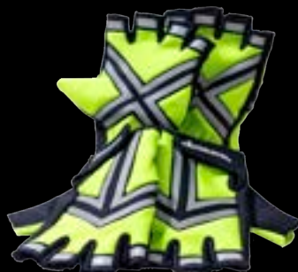
Night time half length